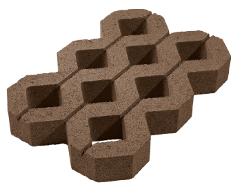
Turfstone 15.60" x 23.50"

Shown: This Gray Turfstone is filled with artificial turf for a greenbelt appearance where reduced maintenance and water use is desired.